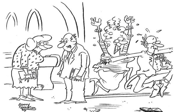
“Red Bull in the communion cups again?”

O God, we pray for a broader vision of the needs of humanity; and a deeper compassion to fill those needs; for a planting of the seeds of concern for all humanity in our hearts; for a tapping of the wells of generosity. May we live together as people who have been forgiven a great debt. May we be gentle, walking softly with one another. May we be understanding, lest we shall add to the world’s sorrow or cause to flow needles tears. May we be as anxious for the rights of others as we are for our own. May we be as eager to forgive as we are to seek forgiveness. May... our love... be like Yours – a love that sees all people as Your children and our kin. May we be ministers of humanity.